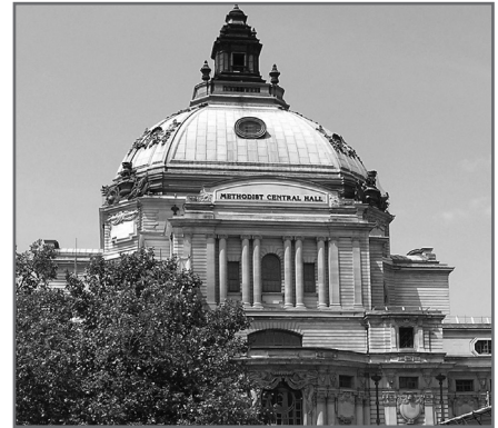
Methodist Central Hall, Westminster, London

The architects were inspired by Westminster's Central Hall, which was finished in 1912. A huge paddle wheel brought in air through the dome. The air moved down. Then it left the building through big doors and chimneys. So fresh air always filled the building. Nobody knows if the Westminster Hall architects were influenced by - or even knew about - the similar natural ventilation system in Turkey's Suleymaniye Mosque, built 350 years earlier.