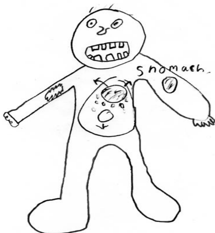
Figure 1. A child's response to the question, "What do you think happens to the food inside your body?"