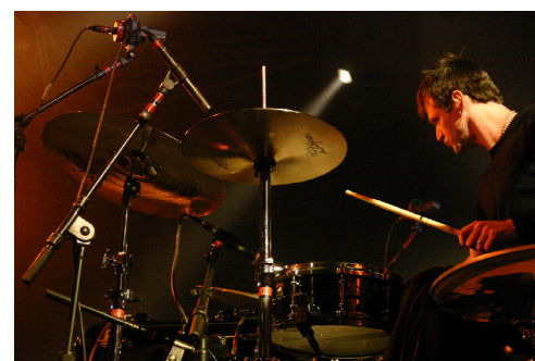
Cymbals for drum kits are thin and light to make the sounds that musicians want when playing with sticks.

This is an oscilloscope trace from an iPhone app. It shows loudness against time. Pure frequencies produce smooth lines. This is a human voice singing a note.