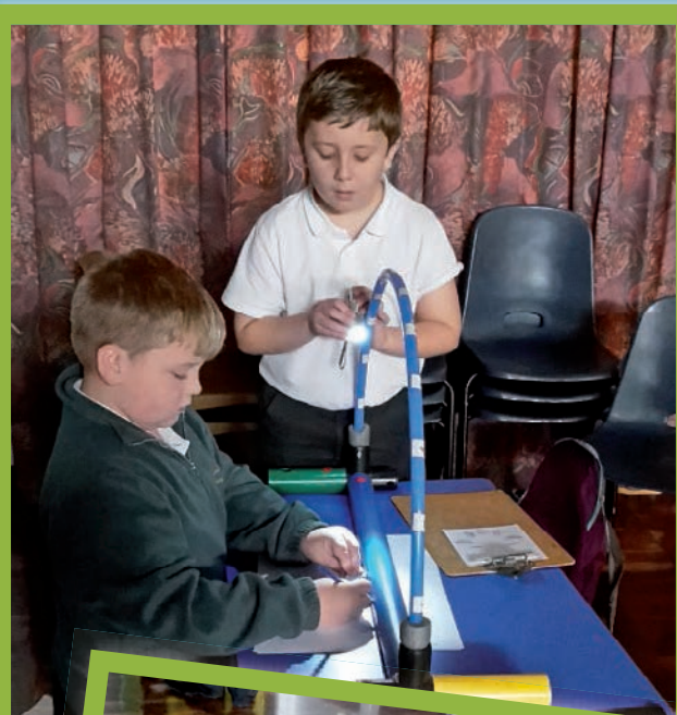
Figure 4 Using the umbragraph to see shadow patterns