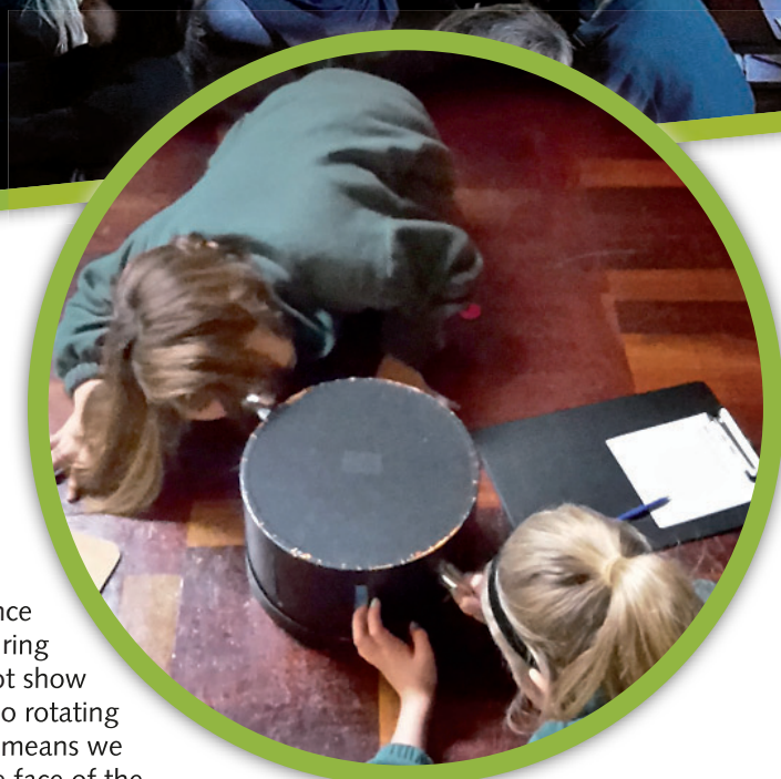
Figure 3 Observing the phases of the Moon

different points on the hoop and draw round the shadows created (Figure 4).