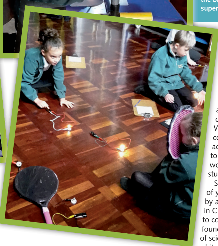
Figure 5 Comparing the brightness of supernovas

the sky. It also shows that the position of the Sun at different times of day changes with the seasons. It does not show that the Sun is a vast distance away from the Earth or that it is actually the Earth that goes round the Sun.