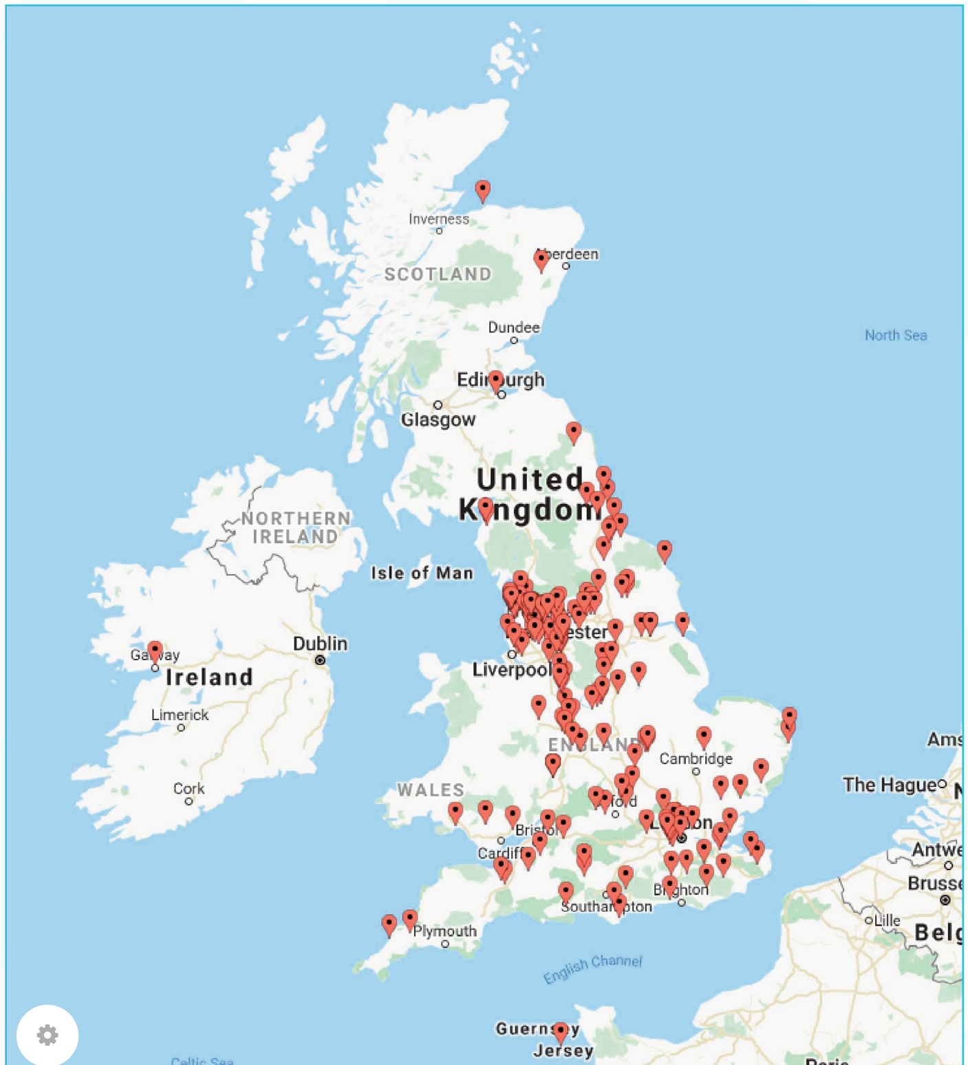
Figure 1. Google map showing pins at the postcode of the registered participants.

Many teachers commented positively on the quality of the resources, which were 'clear' and 'easy to use', and the innovative approach of teaching space science through dance was also commended. In free text responses, more than half of participants commented favourably on this aspect of the scheme, saying that it was an effective delivery method.